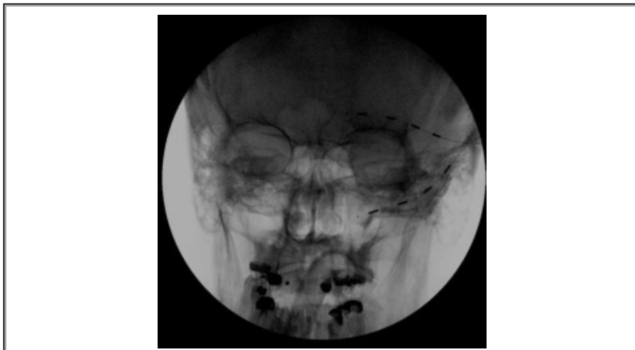
Fig. 1. Anteroposterior fluoroscopic radiograph of Case 1 showing placement of 2 quadripolar electrodes in the left supraorbital and infraorbital positions.

intervention at that time included enucleation of the left eye and a replacement with a prosthetic eye. Subsequently, the patient developed chronic pain over his left face. He underwent 7 operations on the eye with no significant relief in pain. On presentation to our clinic he reported 10/10 pain on a visual analog scale (VAS), which was described as sharp and shooting in the V1 and V2 nerve distribution. His medications included fentanyl patch, oxycodone, gabapentin, and oxcarbazepine, which only provided minimal symptomatic relief. He had also tried alcohol injections, which provided no benefit. After a 10 day PNS trial of the supraorbital and infraorbital nerves, the patient returned to the clinic and reported significant improvement in pain relief. He was subsequently implanted with 2 percutaneous linear quadripolar electrodes in the left V1 and V2 regions that were connected to a RestoreUltra pulse generator (Medtronic, Minneapolis, MN) which was implanted in the left infraclavicular subcutaneous space (Fig. 1). The implanted stimulator was programmed with a pulse width of 390 microseconds and a rate of 40 Hz. The electrode polarities were set to positive in the 0 and 3 positions and negative in the 1 and 2 positions. The patient obtained excellent pain control (0/10 on VAS). The only noticeable side effect reported was occasional